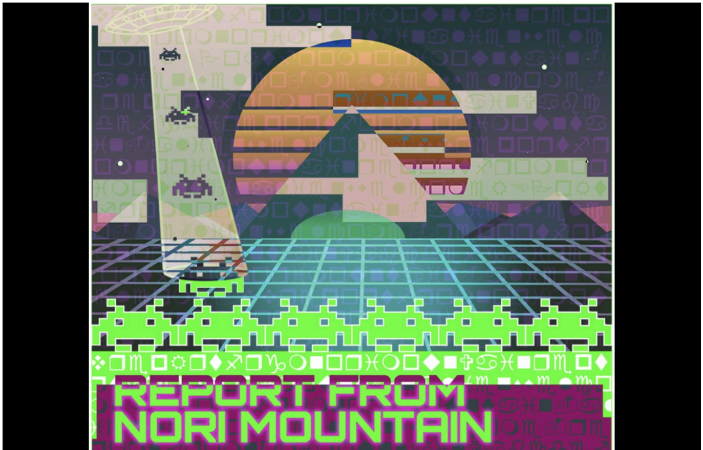
REPORT FROM NORI MOUNTAIN , exhibition poster.